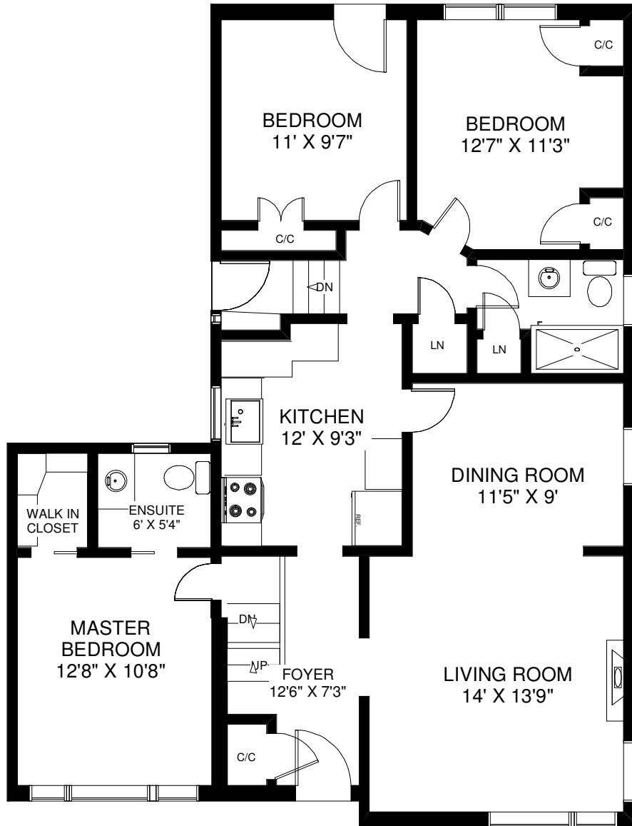
MAIN / UPPER FLOORS APPROXIMATELY 1,225 SQ FT (MAIN 1,000 SQ FT PLUS UPPER 225 SQ FT)